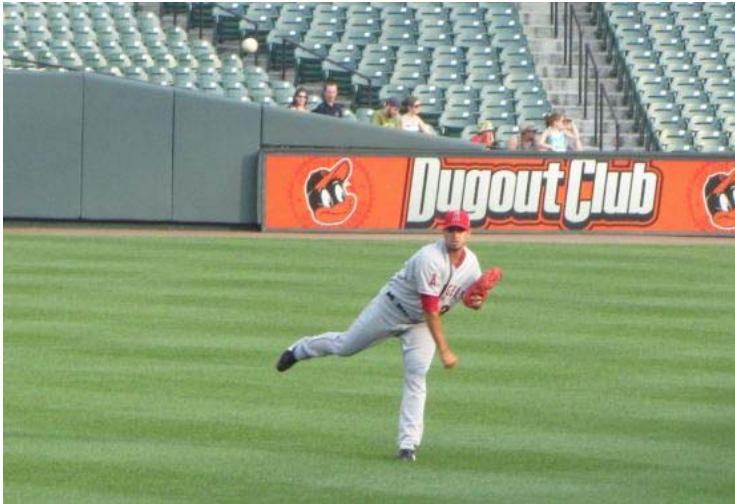
When Piniero moved to the bullpen, Tim and I headed up to the top of section 86 to watch Joel: